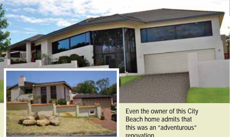
Even the owner of this City Beach home admits that this was an "adventurous" renovation.